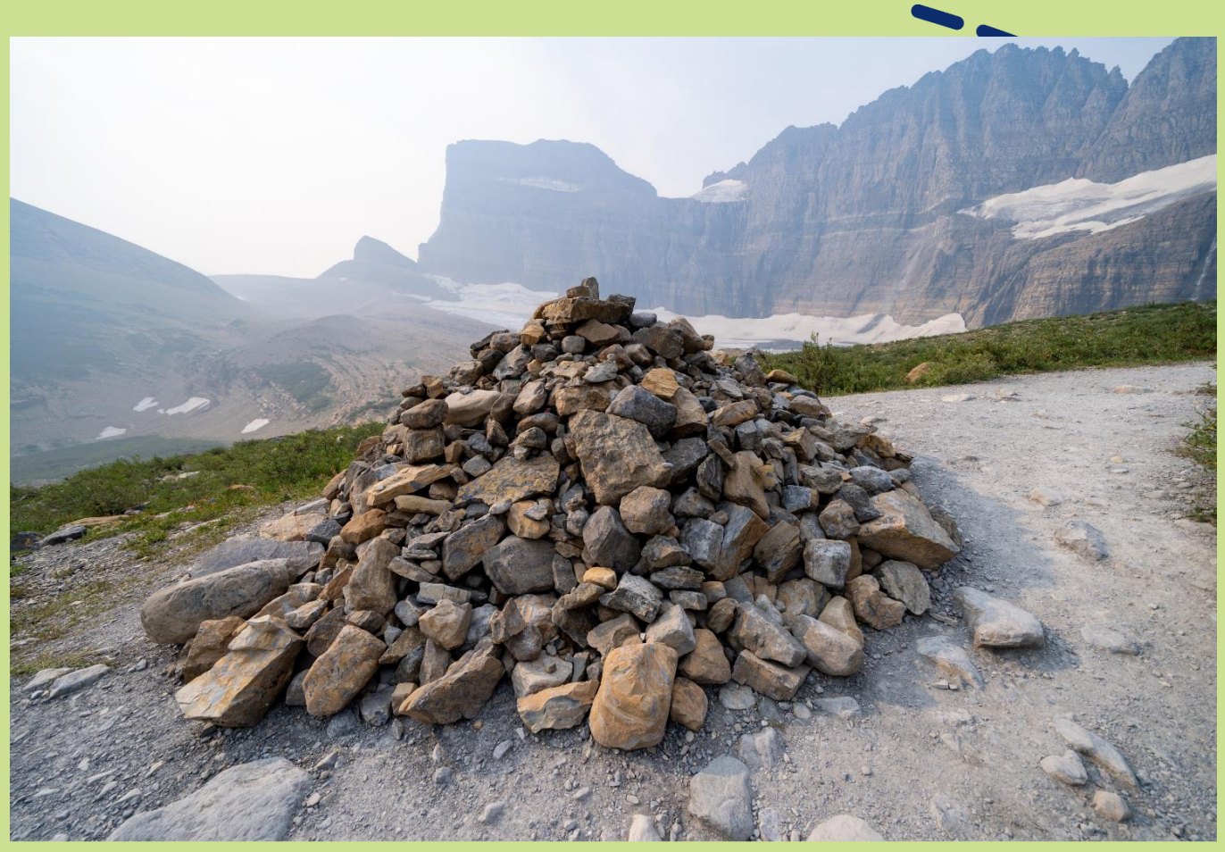
Large pile of rocks at the top of Grinnell Glacier Trail marks the summit of the trail, in Glacier National Park Montana, photo by Melissa Kopka.

Ideas for next steps when your library has achieved the basic public library standards